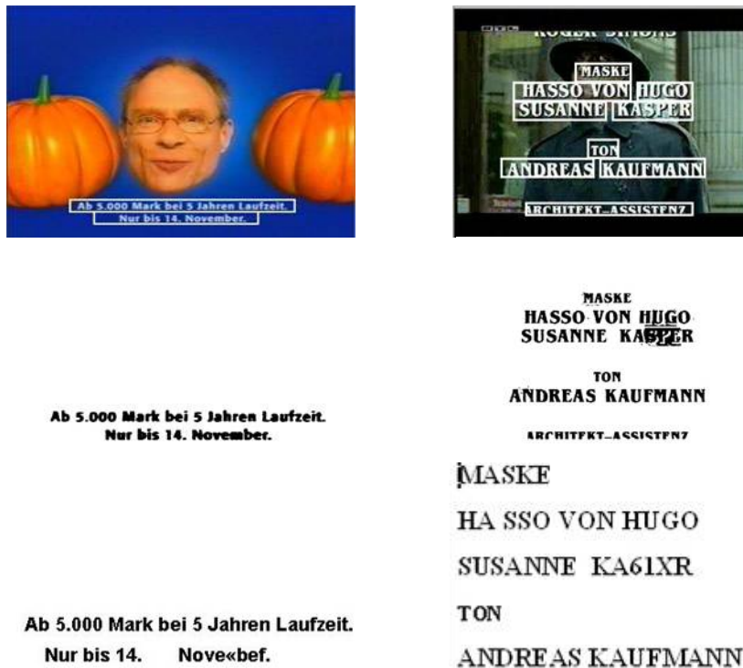
Figure 3: The images on the top row show the result of text localization. The middle row depicts the results of the text segmentation process, in which the background has been removed and the text has been marked black. In the last row, the result of the recognition software (OCR) is shown.

(Gllavata/Ewerth/Freisleben, 2004b). The proposed text segmentation method was able to boost the word (character) recognition rate from 62% to 79% (76% to 91%) on a set of test images (Gllavata/Freisleben, 2005). Recently, the Tesseract OCR engine (Vincent, 2006) has been integrated into Videana , such that the software is now able to annotate shots with localized and recognized words automatically.