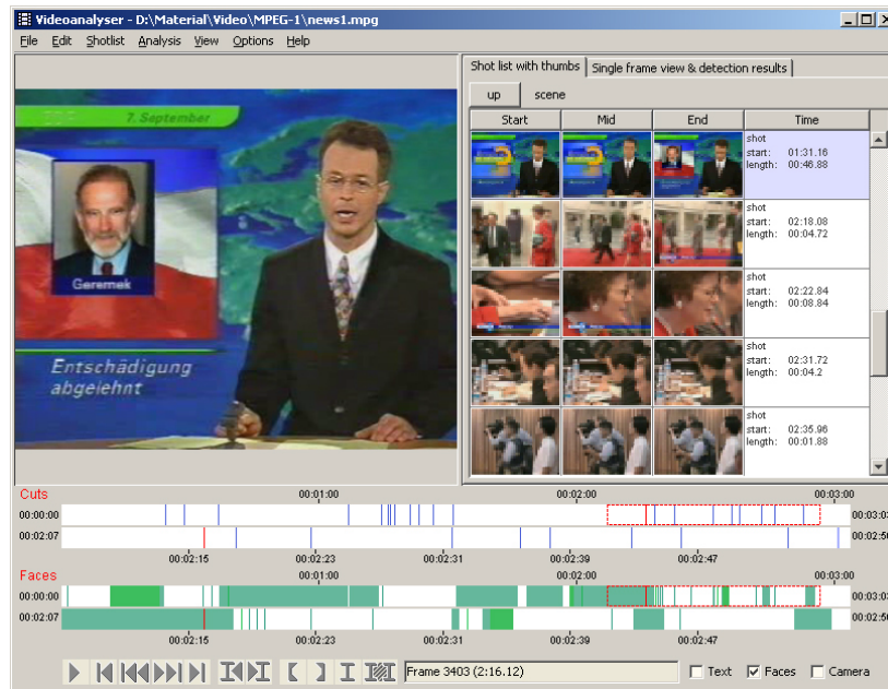
Figure 1: The main window of Videana . On the left side, there is a window for playing a video. There are two timelines at the bottom which visualize the analysis results for the temporal segmentation of the video into shots as well as for face detections. The vertical lines in the Cuts timeline represent cuts (abrupt shot changes), the colored areas in the timeline Faces mark the sequences where a frontal face appears. Two timelines are presented for each kind of event: the upper one represents the total duration of a video, whereas the lower one zooms into a certain time period which can be selected in the upper timeline and is surrounded by a red rectangle. Further timelines are displayed in case that the corresponding analysis results or user annotations are available for the related events of camera motion, superimposed text or audio events. On the right side, the temporal segmentation is presented in another way. Single shots are represented by three frames (beginning, middle, and end frame of a shot). By a mouse click on an icon, the related video frame is accessible directly, while a double click starts playing the video from this position.

Up to now, the following automatic video content analysis algorithms are integrated in Videana : Shot boundary detection, text detection and recognition (video OCR: optical character recognition), estimation of camera motion, face detection, and audio segmentation which segments the video into sequences of silence, speech, music and background noise. Based on a plug-in approach, any type of analysis algorithm can be updated, exchanged or removed easily. The graphical user interface (GUI) of Videana allows users to play videos and to access particular video frames. Furthermore, the GUI allows users to manually correct erroneous analysis results.