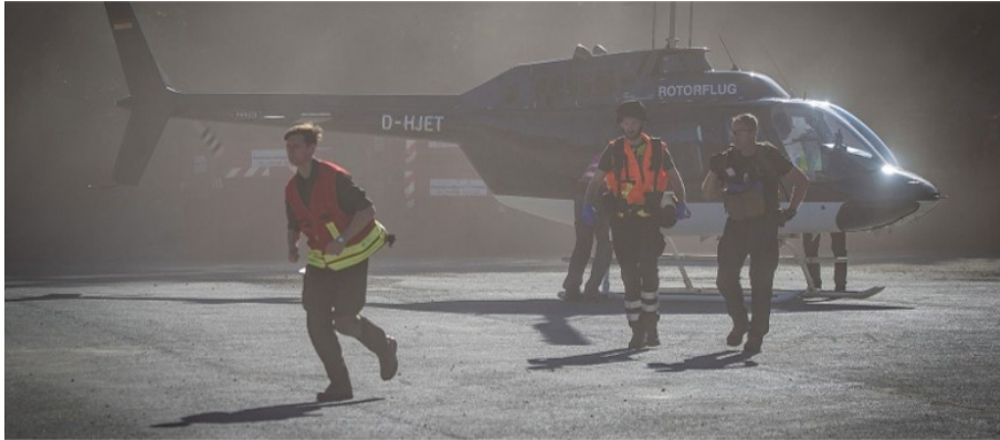
Fig. 2 Example of a catastrophe scenario as used in the described resilience research (Merkt and Wilk-Vollmann, 2021): Role play is used to create realistic, stressful crisis situations; data is collected during and after the scenarios from the participants to reflect their stress level (picture shows one of the authors).

questionnaires for subjective assessment of the stress level are taken based on standardized interview settings.