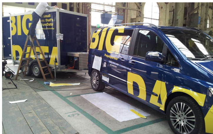
Figure 2: Snapshot from the preparations of a business road show in illustration of the hopes and dreams connected with the term “big data” as used by the public press around 2013. The hopes and dreams have been seamlessly transferred to other wording as of the writing of this book. This is in stark contrast to the continuous scholarly work on big data discussed e.g. by Valerazo et al. (2016) and the scientific community that adopted the same name 11 .

The scientific and commercial development of data science has been accompanied by considerable buzz in the public press. In this section, we review the contemporary trends of big data, AI, and digitalization, respectively, and put the terms into the context of the professional discussion. Our goal is to disentangle the meaning of the terms as hype words from their scientific definition by showing discrepancies in public understanding from what experts refer to when using largely overlapping vocabulary, thus contributing to a successful dialog.